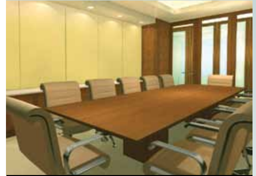
Dean's Suite Conference Room