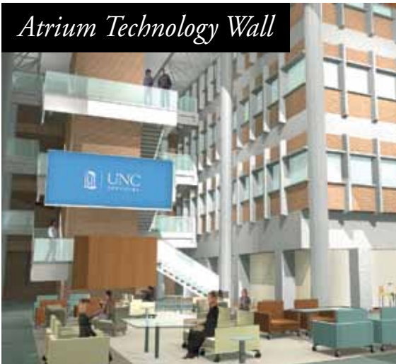
Atrium Technology Wall

To see a current photo of the Dental Sciences Building, please visit http://oxblue.com/pro/open/bek/uncdental See the Dental Sciences Building pages at the UNC School of Dentistry website at http://www.dentistry.unc.edu/foundation/dentalexcellence/